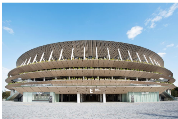
Japan National Stadium

For this second NAGASE Cup, with the intent of holding it in various cities so more athletes and spectators have a chance to participate, the venue has been changed to the Japan National Stadium. With a larger lineup of events and programs, we are also aiming to make it into “an inclusive competition anyone can join.”