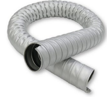
(4) Heat Resistant Ducts