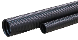
(2) POLYETHYLENE SHEATH