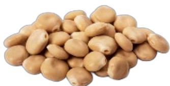
Sweet Lupin Seeds

Active Ingredient: Sprouted Sweet Lupin Extract Protein (BLAD)